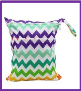
Wetbags for wet and dirty clothes